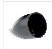
Tilted mounting frame: Easy to install