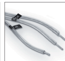
Mounting options: car and display