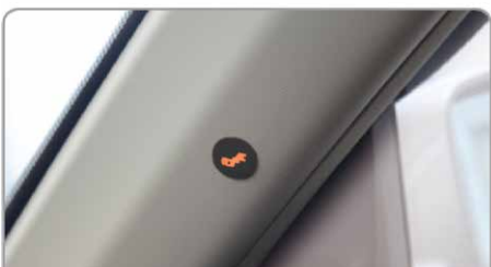
LED Visual Alert